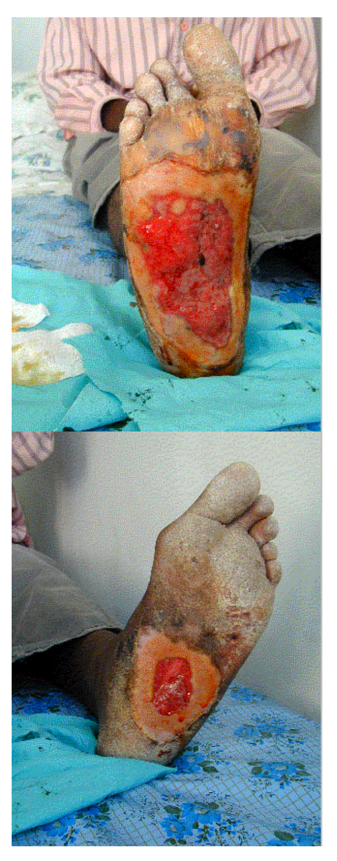
Photographs 1 and 2: deep wounds on soles of feet reportedly caused by torture with burning logs. Findings in complete agreement with this.