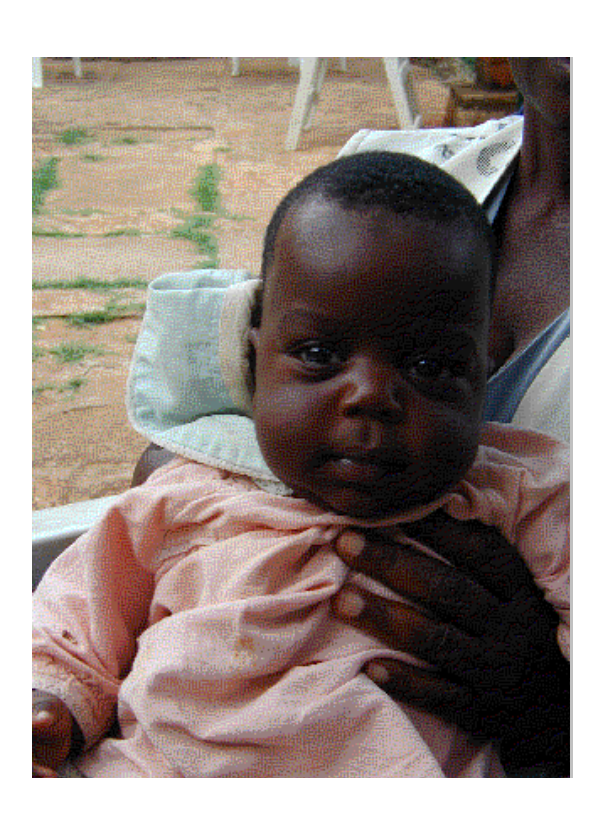
Photograph 3, Case 2: 4 month old baby, reportedly beaten form political reasons at the age of 1 week.