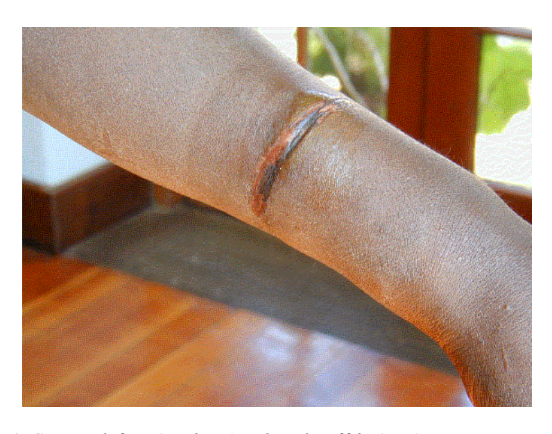
Photograph 4, Case 5: left wrist showing hand cuff lesion in agreement with the history.