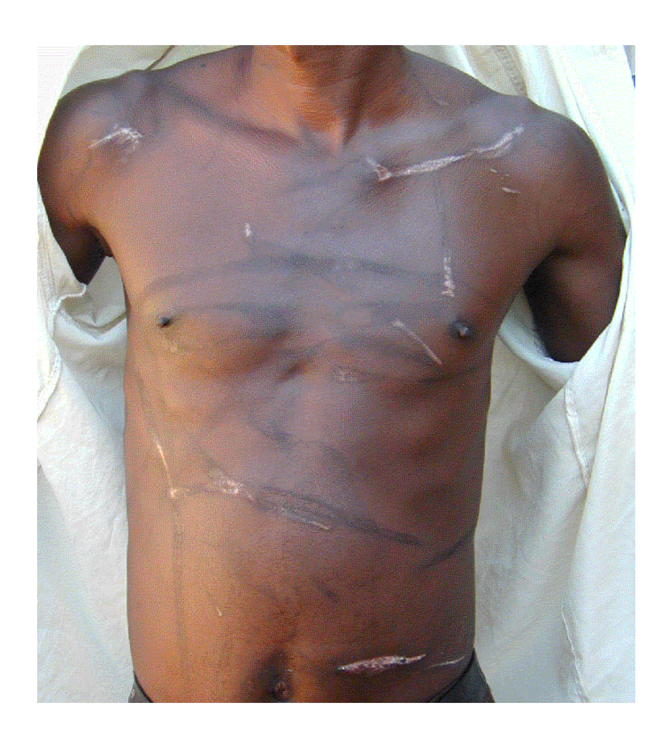
Back cover photograph, Case 11: long lesions caused by beatings with sjamboks and a chain. Findings in complete agreement with history.